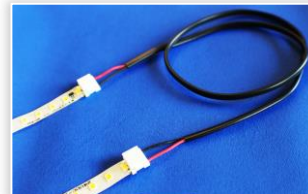
CON20-PF Power feed for white tapelight with 20" cable