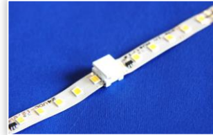
CON2-JC Jumper Cable with 2" cable