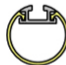
VT01 + VT01-SL