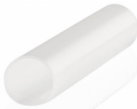
VT01-SL Satined Round lens PMMA, 82% transmission