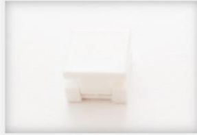
CON-S Splice connector