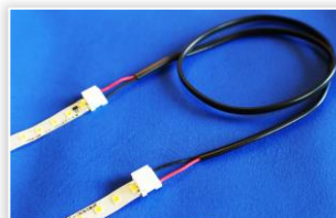
CON20-PF Power feed for white tapelight with 20" cable