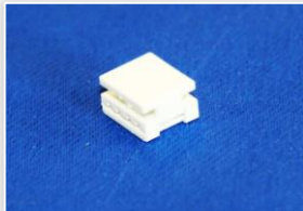
CON-S Splice connector