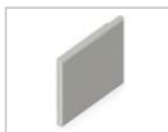
End Cap for 90° Lens