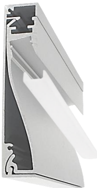
LAC99-SL Satin Lens