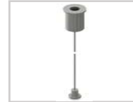
Cable Suspension Kit